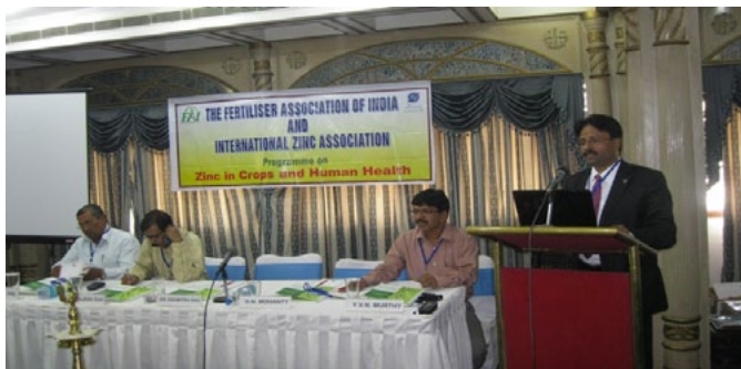
Zinc Fertilizer Training Program, November 2011 in Bhubaneswar

IZA’s Zinc Fertilizer Training Program was developed to assist ZNI members and other key stakeholders in educating sales and extension personnel on the key attributes and benefits of zinc fertilizers. The one-day program, facilitated by IZA’s zinc fertilizer experts, provided a complete overview of zinc deficiency in crops and humans and the use of zinc fertilizers. Ten such training programs have taken place in India during 2011. The programs have been represented by all the leading fertilizer companies in India, including ZNI members IFFCO, Nagarjuna Fertilizers & Chemicals, Coromandel International, Deepak Fertilisers & Petrochemicals Corporation, and Tata Chemicals.